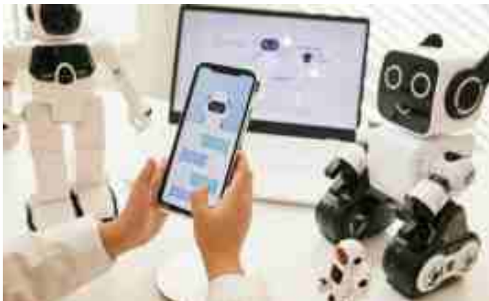
Mobile concierge service(SNS)