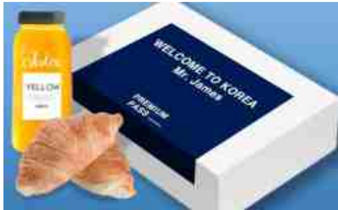
Special snack box