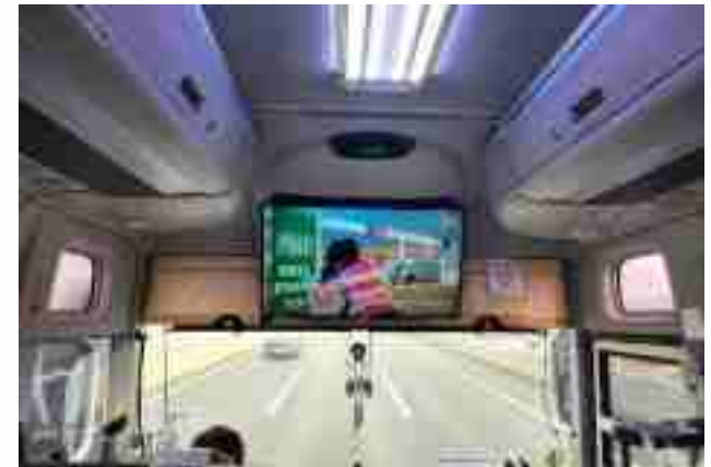
Show tour-related video while transferring