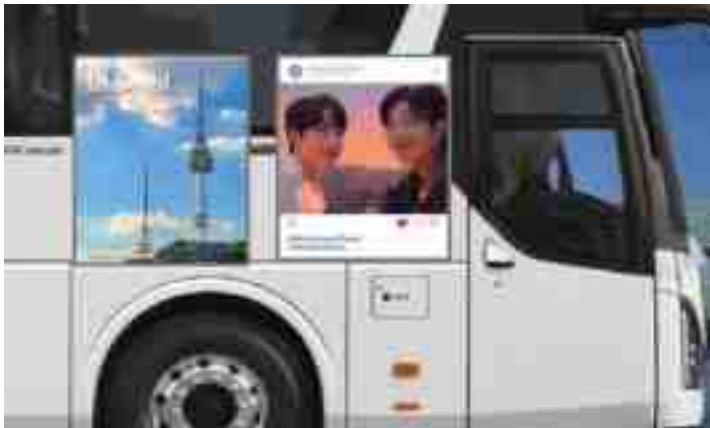
Unique Photo zone composition

We have customized heart-touching services such as vehicles, tours, concierge, etc.