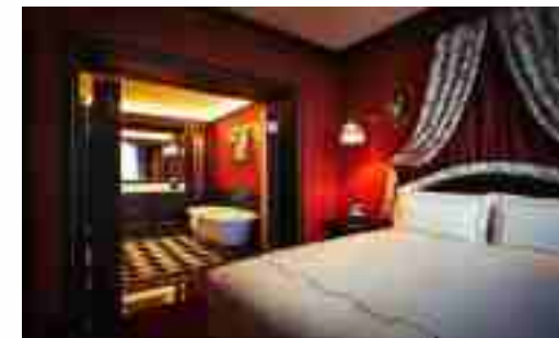
Special accommodation (Unique Venue)