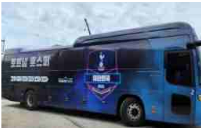
Custom vehicle wrapping(on request)

Comfortable, safe, customized customer service that prioritizes customer satisfaction